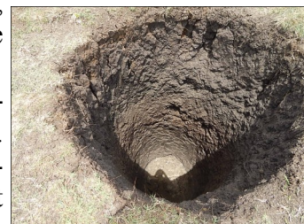
Our new well being dug for the work at NHOM.

We have to be careful that we select the right staff and personnel to minister to the needs and cares of these needy children. We invite you to visit us and see for yourselves what is going on at New Hope Children's Village. Just to fill you in on some of the needs. We need a fence built around our compound. We need a number of bunk beds for more children. We need a study hall and recreation room for the students and faculty. We need a van for transportation. We need a small clinic and first aid supply facility. We need people who will sponsor a child for $35 per month. If you can help in any of these areas we would so greatly appreciate your assistance. Our task is a giant one and the need is sometimes very overwhelming but we know who can meet all our needs and we are trusting Him, for the battle is not ours but His.