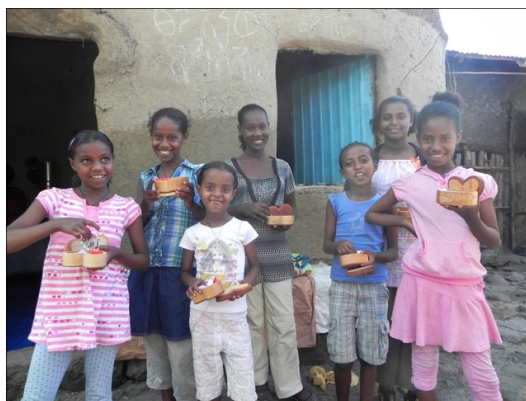
Our girls showing off their heart boxes made by a good friend of NHOM International in Forks, WA