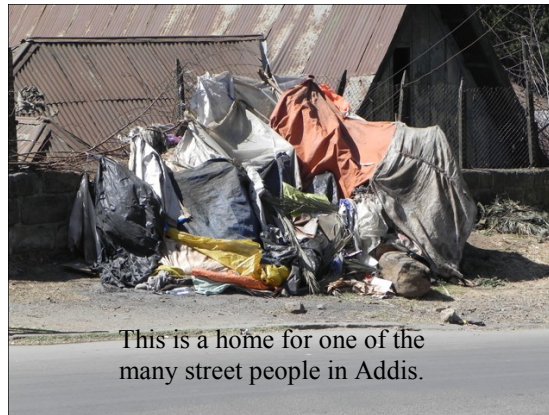
This is a home for one of the many street people in Addis.

$500 Monthly Rent $20,000 Van $500 School Supplies