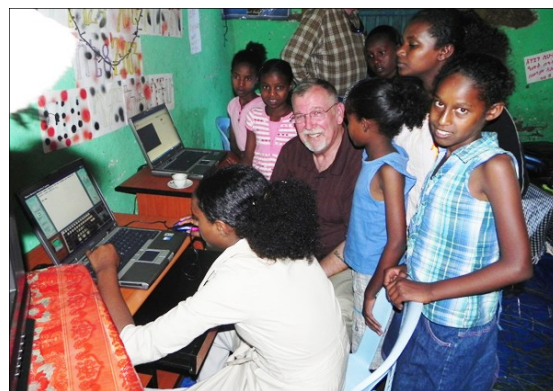
Our girls getting hands on experience on the first computers they had ever seen.

19 Lewiston, ID 19 Medical Lake, WA 20 Medical Lake, WA