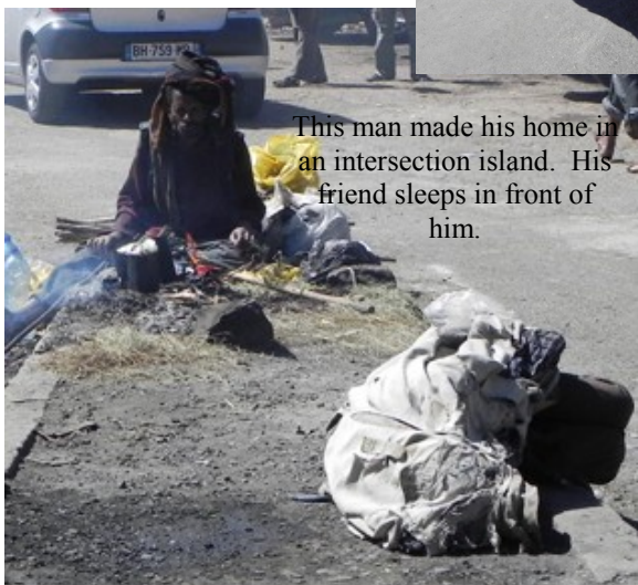
This man made his home in an intersection island. His friend sleeps in front of him.

We would love to have you join us on one of our life changing missions trips. To find out more information on trips to Russia, Ukraine, Sri Lanka or Ethiopia contact us at 253-875-3202 or e-mail us at nhomjohnny@gmail.com . Each trip is unique and involves many ministry opportunities.