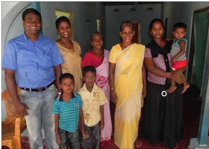
The older woman in yellow is the one who gave me everything she had to help the orphan's in Russia. She is surrounded by her family.

In the afternoon we met with a young widow and her widow mother. Both husbands were killed in the war. Every Tamil living in this area has horror stories about how events took place in the slaughter of some 40,000 plus people in 2009. God is a just God and He will have His time.