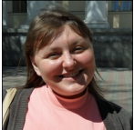
Viktoria Odessa, Ukraine

We have so many volunteers in our church that want to travel with us to the orphanages. They are such a blessing as they share in the work we do. They put aside everything to blow up balloons, share stories, become clowns or an overstuffed cartoon character and to give the children and elderly hugs in the name of Jesus. Our church is very supportive of the work NHOM International is doing in our Odessa Region. God Bless You All!