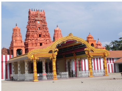
Though all most all churches were destroyed in the war not one of the Hindu or Buddhist temples were touched. Above Hindu Temple in Jaffna.

The church in Kandy has workers that visit the villages of these tea pickers. They have begun Sunday Schools amongst the villages and now over 400 children and adults attend. NHOM International has sponsored and help support this very important ministry for several years. We need your generous support to continue reaching the unreached with the Gospel of Jesus Christ.