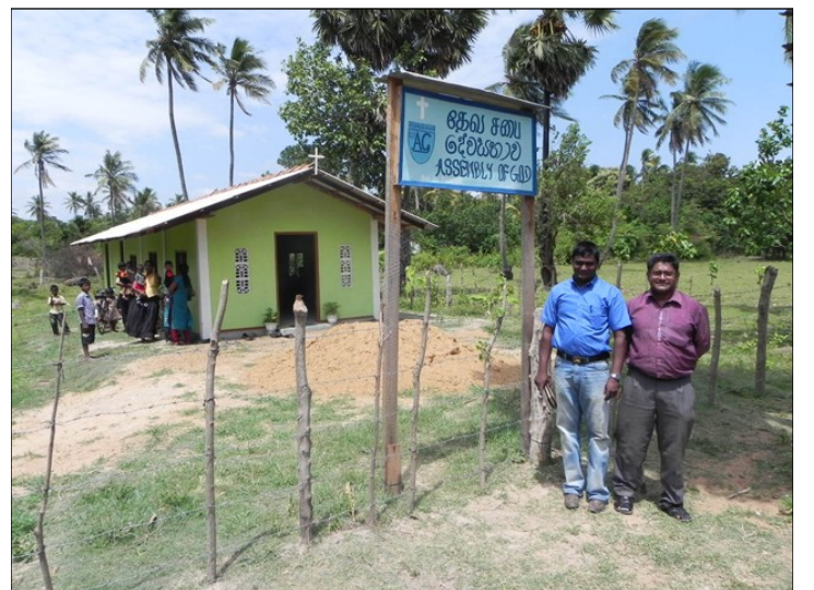
The little church I talked about on the front page.

My teams must endure dangerous situations to minister to the widows of this region. Snakes, wild animals, land mines and even terrorists but they persevere because it is the right thing to do. The tsunami of 2004 took approximately 50 thousand lives in this area. The civil war in 2009 also took about 50 thousand lives. Now it is time to rebuild. Together we can make a difference.