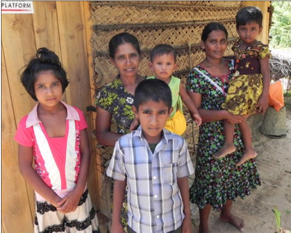
While in the jungle of Vanni we met this mother and daughter who are both widows. Both their husbands were killed in the war and they are simply left to fend for themselves in a very hostile environment..

Pictured above are just some of the widows we support on a monthly basis. We desperately need your help to support more. We are the only source of help these ladies and their families have. We not only provide some physical help to them but we provide sound Christian teaching as well. There are tens of thousands of these widows who simply exist on whatever they can find to eat. These are just a few who have lost everything they owned because of the civil war. We can and we should help these who society has rejected. Widows are the lowest of the caste system and are rejected by Hindus, Muslims and Buddhists. We can blame religions for their plight, we can blame society for the foolishness of a caste system or we can help them by the demonstration of what Christians should do. James 1:27 says; Pure religion and undefiled before God and the Father is this, visit the fatherless and widows in their affliction and keep yourselves unspotted from the world.