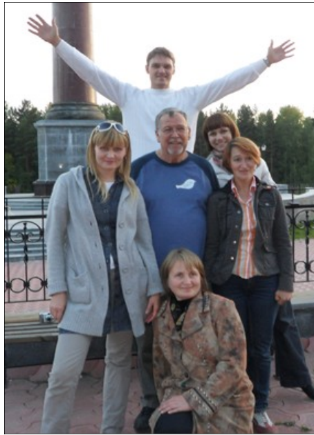
Our Ekaterinberg team celebrating a victorious trip as we take communion at the Continental Divide between Asia and Europe.