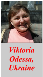
Viktoria Odessa, Ukraine