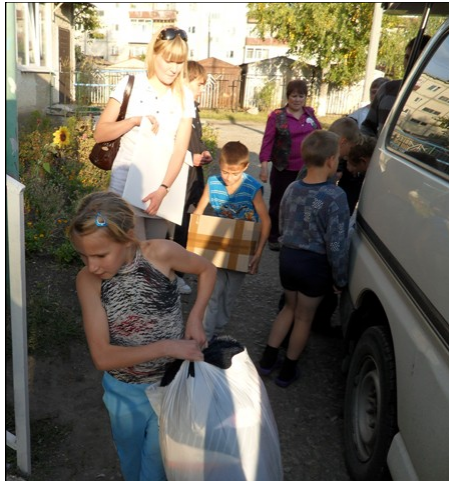
At every orphanage kids come and help carry supplies and materials for the programs we present. They are so glad to help us and we are blessed by them.