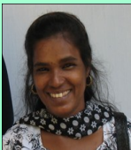
Saratha Jaffna, Sri Lanka