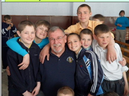
Here I am just hanging out with some of my favorite people in Russia.

God love them and therefore we must love them as well. They are His creation and our neighbors and we must love our neighbor as we love ourselves. Won't you help us continue to reach these that are so desperate?