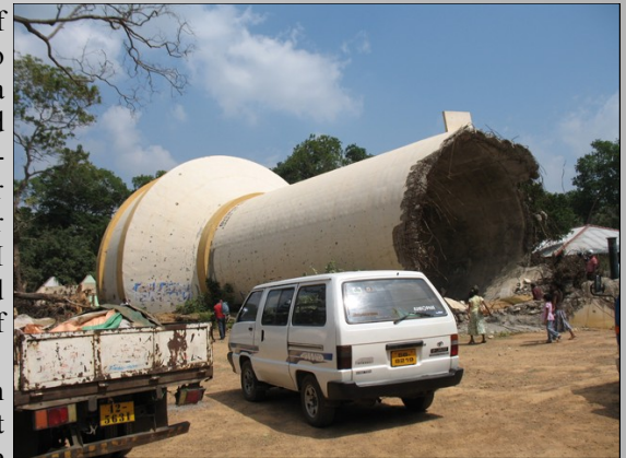
A water tower that was blown up near the junction of the Vanni turnoff.

While the war was raging in the North and the West the rest of the country had no idea what was happening because all news was censored. Only stories of heroism on behalf of the Sri Lankan military was given.