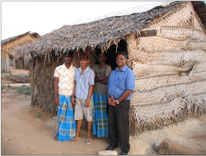
There are now many new displacement camps set up because of the war. Displacement camps are supposed to be temporary places but there are some that have been in existence for over 20 years and still no governmental involvement to find permanent homes for those who were displaced because of the war.

prisoned or sent to camps. Miles and miles of total destruction. If you were there for the first time you would not even know that a war had taken place except for the war memorial. Nor would you know that villages were where you are standing. But I