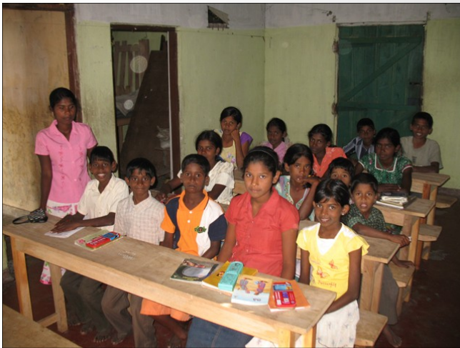
Some of the Christian kids learning about their faith in a public school religion format taught by teachers we support.

prisoned or sent to camps. Miles and miles of total destruction. If you were there for the first time you would not even know that a war had taken place except for the war memorial. Nor would you know that villages were where you are standing. But I