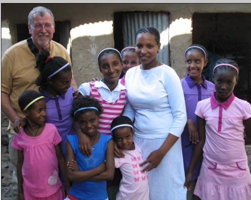
These are some of the orphan girls we have in our NHOM home. They are showing off their new dresses brought from the USA.