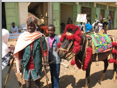
This was an interesting fellow and his horse we saw at the local market place in Debra Markos, Ethiopia.