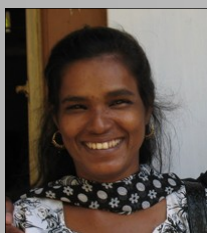
Saratha Sri Lanka