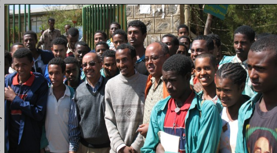
Pictured above are some of the students we met in a village near Bahar Dar