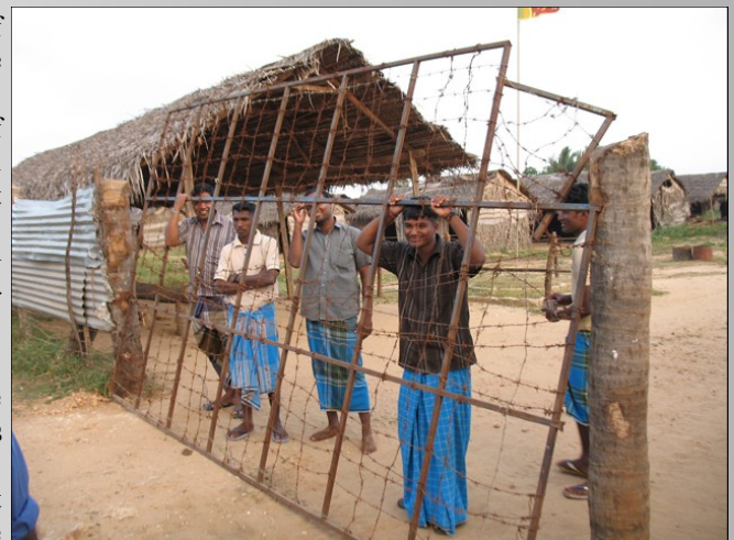
The Guantanamo Bay of Sri Lanka. A prison camp housing over 4,000 men just outside of Jaffna who were believed to be part of the Tamil Tiger terrorist organization.