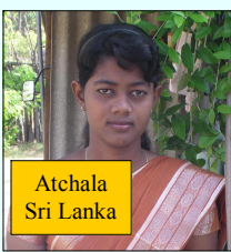
Atchala Sri Lanka