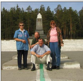
Here our group of Americans sit and stand on the border that separates the continents of Asia and Europe. I am straddling two continents.

We were in small villages and big towns and one major city and we covered well over 3,000 kilometers on rough Russian roads. We taught in Bible school, visited a drug rehabilitation center, preached in several churches and witnessed a tremendous move of God's Holy Spirit. Hundreds of people responded to the altar calls for salvation, repentance and healing. One in our group said that it was the first time he had witnessed miraculous, supernatural healings. What a blessing to be part of this special time.